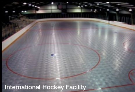
International Hockey Facility