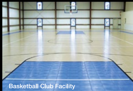
Basketball Club Facility

MADE IN THE USA, PLAYED ON AROUND THE WORLD