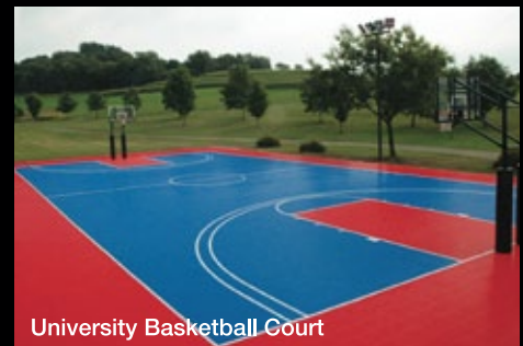
University Basketball Court

MADE IN THE USA, PLAYED ON AROUND THE WORLD