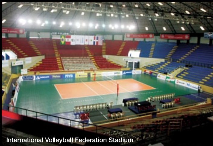
International Volleyball Federation Stadium