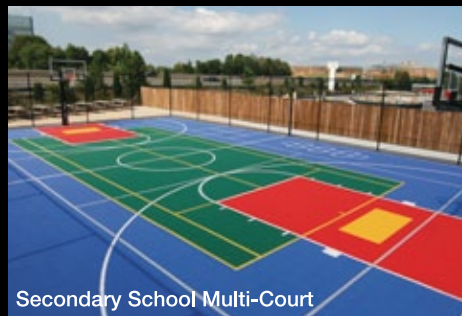
Secondary School Multi-Court