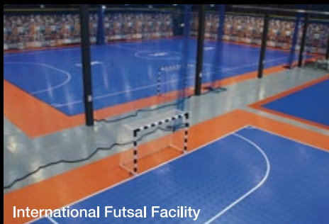
International Futsal Facility